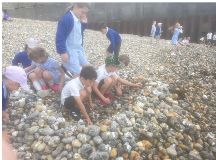
Owl Class went to Samphire Hoe and enjoyed some time at the beach after their Stone Age workshops.