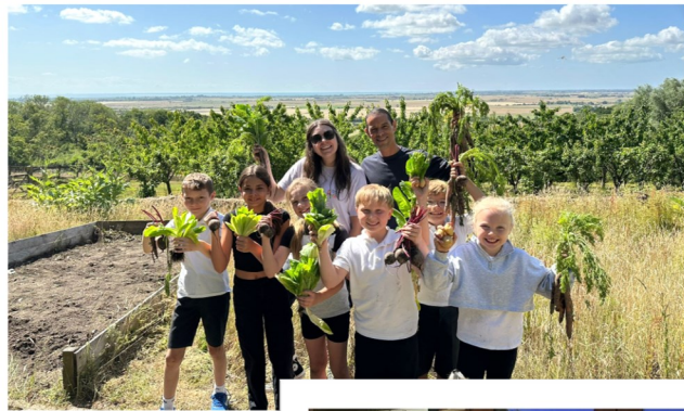
The Eco team had a great time harvesting the vegetables they planted. They were delivered to the local villagers at the HUB.