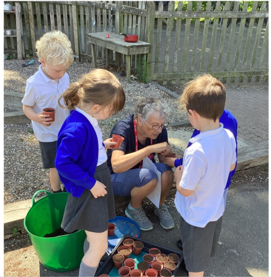
Panda's have been busy planting sunflower seeds, searching for dinosaur clues and enjoying the new role play stage.