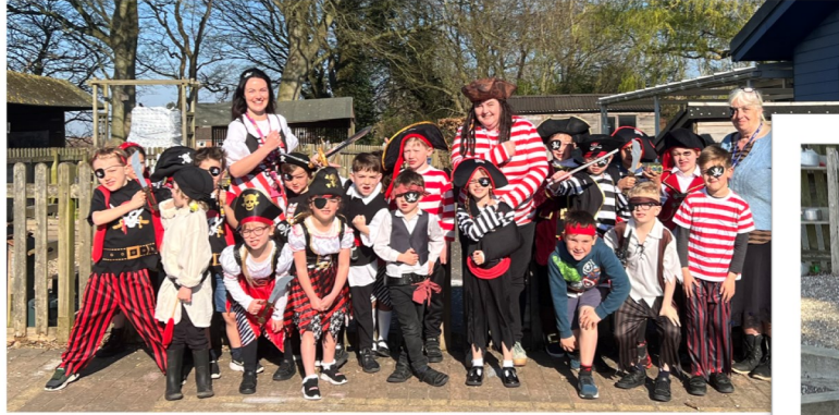
Otters had a gggggggreat pirate day last term.